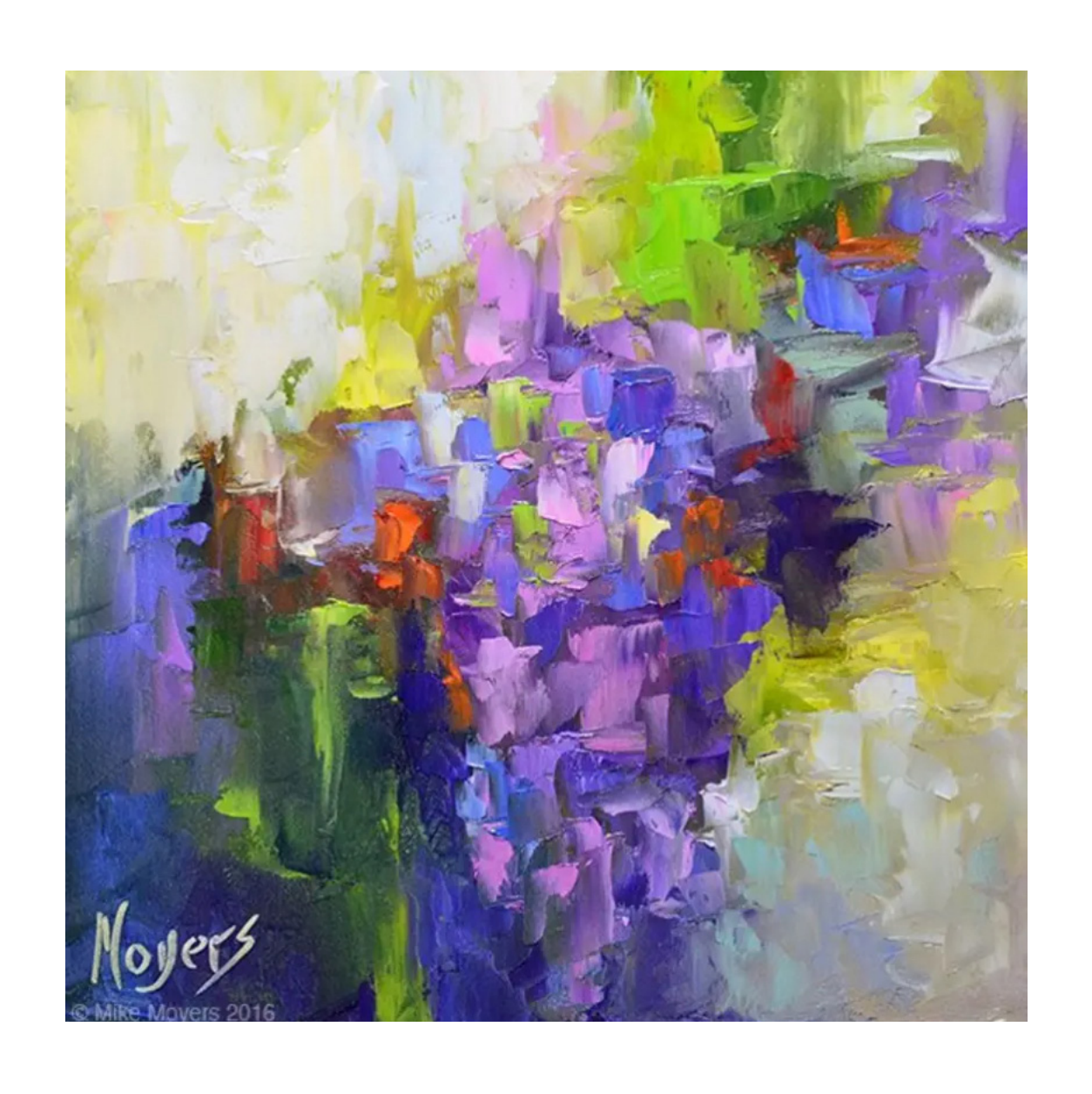
Sunday Worship April 21, 11:00 a.m.