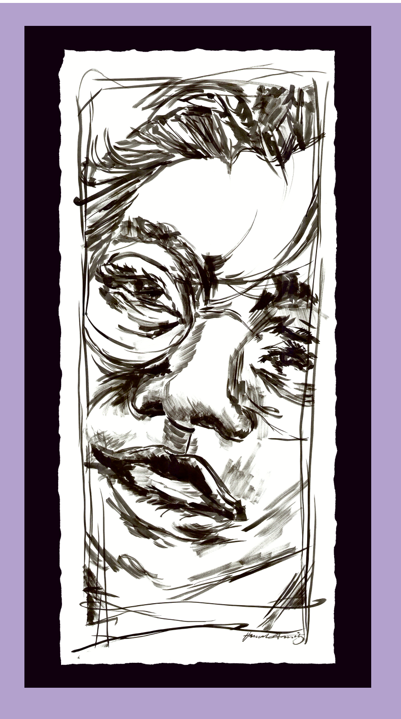
Sunday Worship March 10, 2024 – 11:00 a.m.