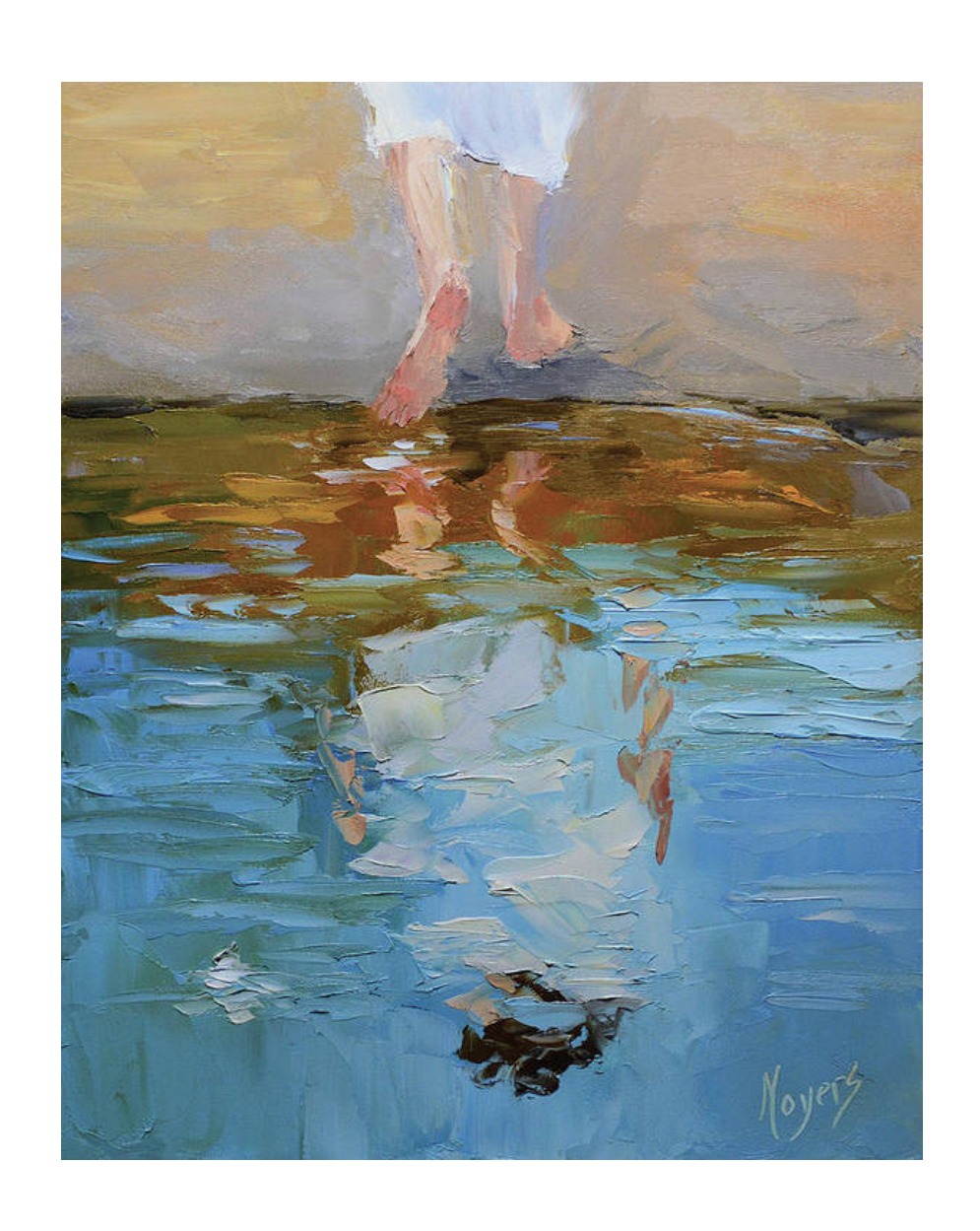
Baptism of Our Lord